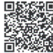
QR Code for Church Center App

Womens Bible Study– Ephesians – The Wiersbe Bible Study Series-9 weeks beginning Jan 27-meet in the café at 7PM. Come learn how to be rich in the Lord— and how to step into the riches He promises His people. You can register online, through our website or the Church Center App. I have 30 books, they are $9.00. You can also purchase your own book through Amazon, Chritianbook.com etc.