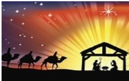
Dan Scanish Dec 22, 2024